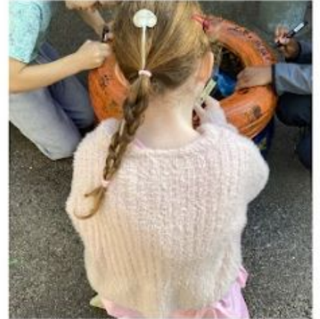
Year 4 ROSE day