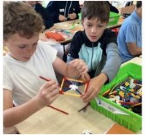
K'NEX rocket challenge. Year 6