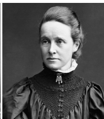
Millicent Fawcett 1847 - 1929