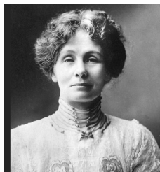
Emmeline Pankhurst 1858 - 1928