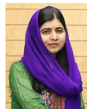
Malala Yousafzai 1997 -