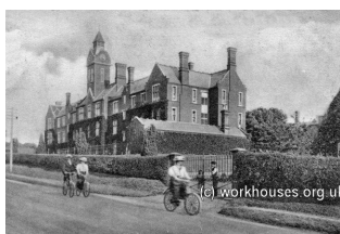
Workhouse in Hertford

Victorian Workhouses were established in 1834 by Sir Robert Peel. They were designed to allow people who could work but couldn't get employment locally, to work in return for shelter and food.