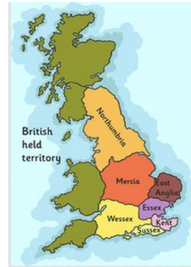
7 Anglo-Saxon Kingdoms