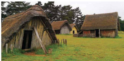
Reconstruction of a Saxon settlement