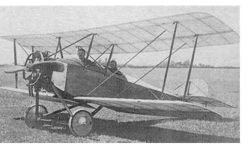
A biplane has 2 wings. This type of and from the efficient fill of