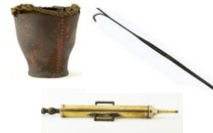
Fire fighting equipment