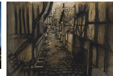
A London street like Pudding Lane in 1666