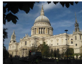
St Paul's Cathedral