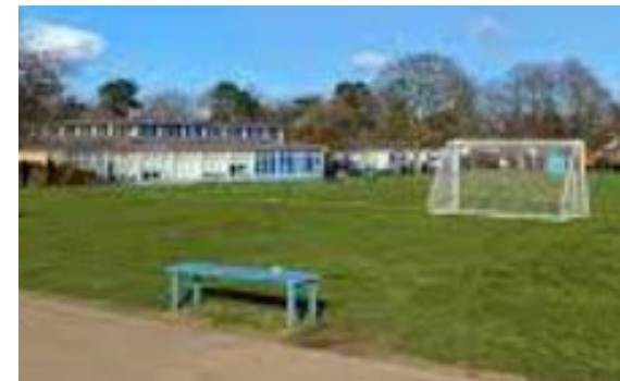
Morgan's School field