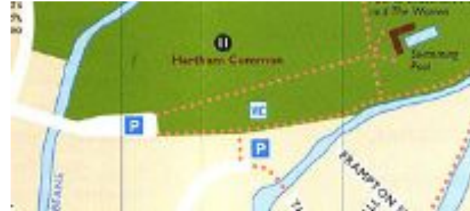
Map of Hartham Common