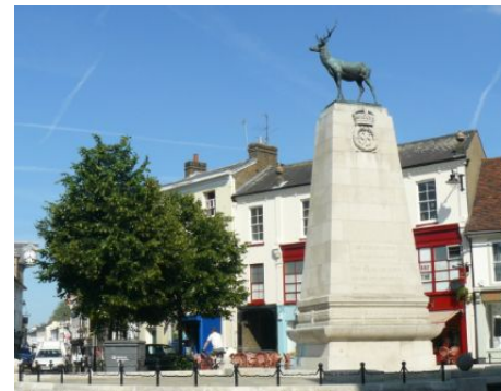
Parliament Square, Hertford